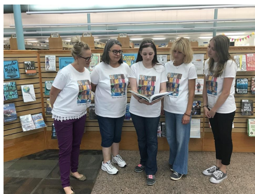
Staff of the Marble Falls Library